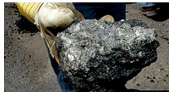
A City of London worker holds some asphalt before it is heated in a truck equipped with an infra red heater box. The heating takes about 20 minutes depending on the air temperature.